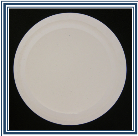
Figure 1: Membrane Patch Colorimetry - Sample Patch.

Normal Range: This means that there are low levels of the precursors that lead to soft contaminants (varnish).